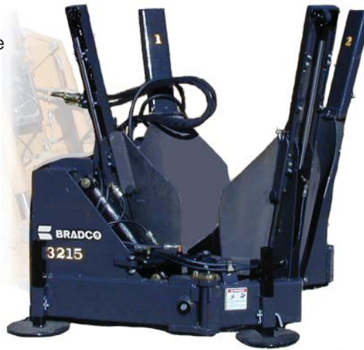
15 Series Tree Spade