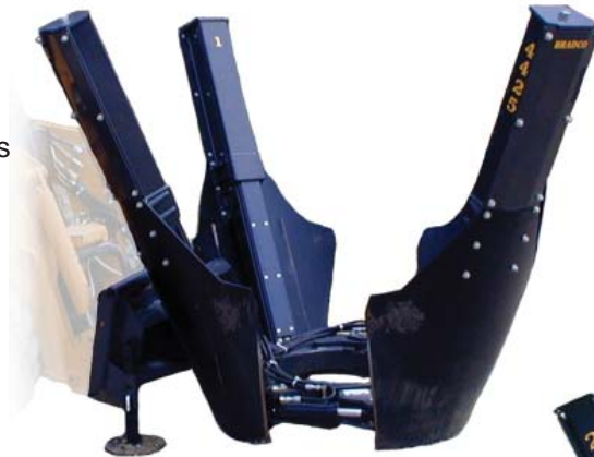
25 Series Tree Spade