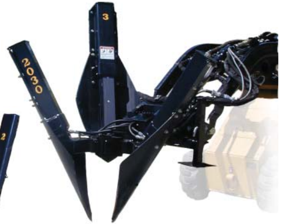
30 Series Tree Spade